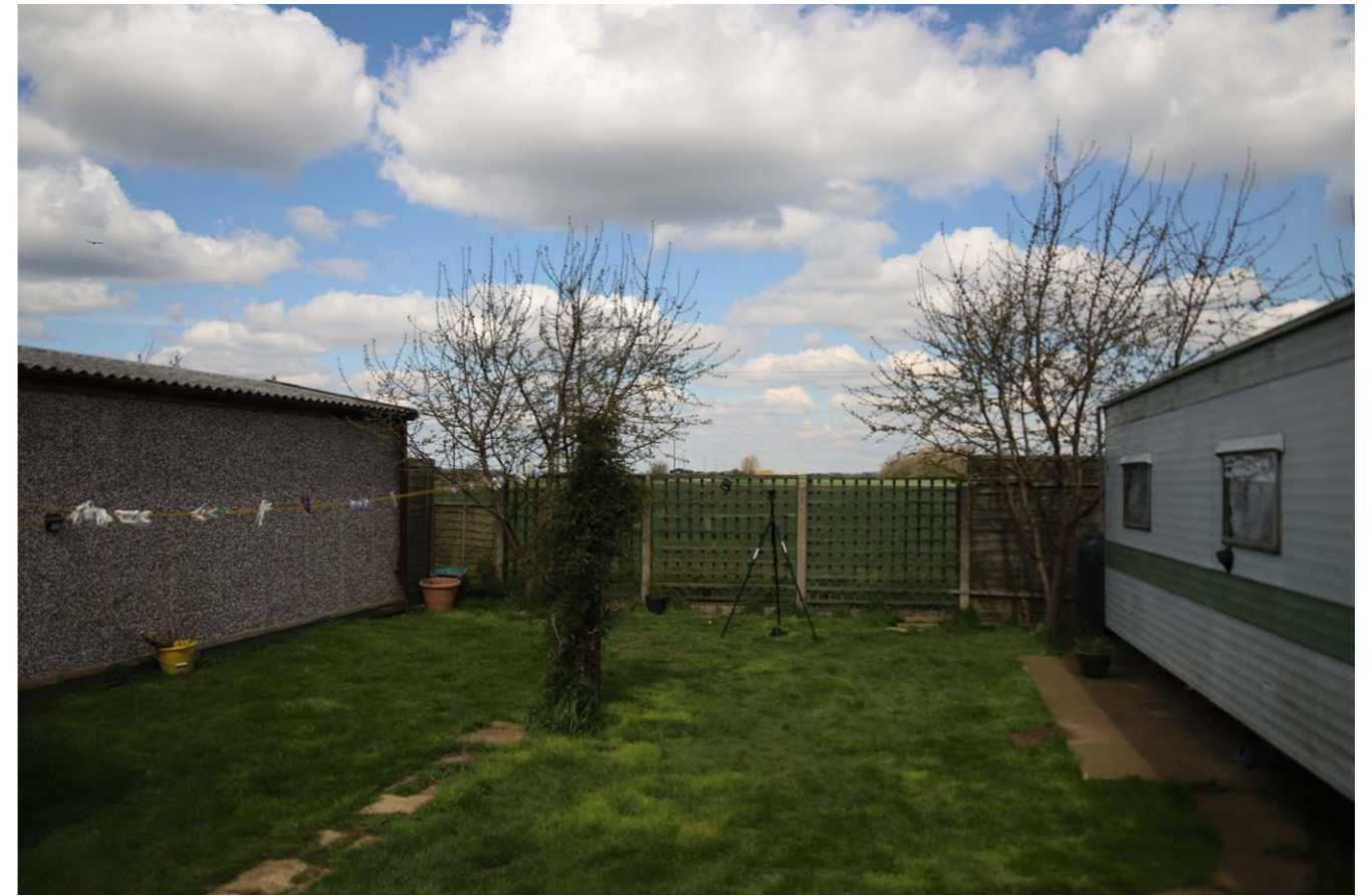
Rear garden, looking north towards the Energy Park