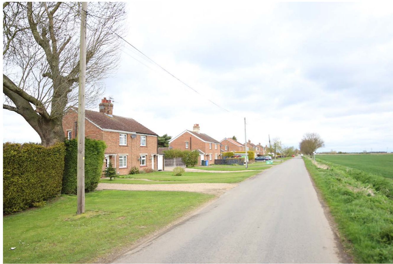
Eastern elevation addressing Brown's Drove