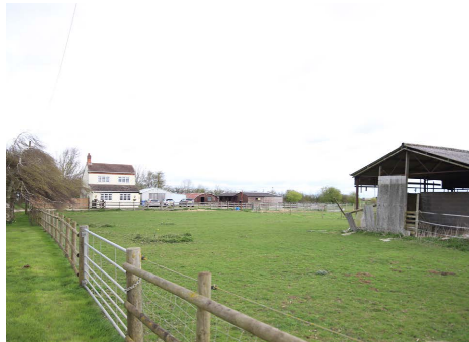
View towards the Energy Park from the northern edge of the cluster