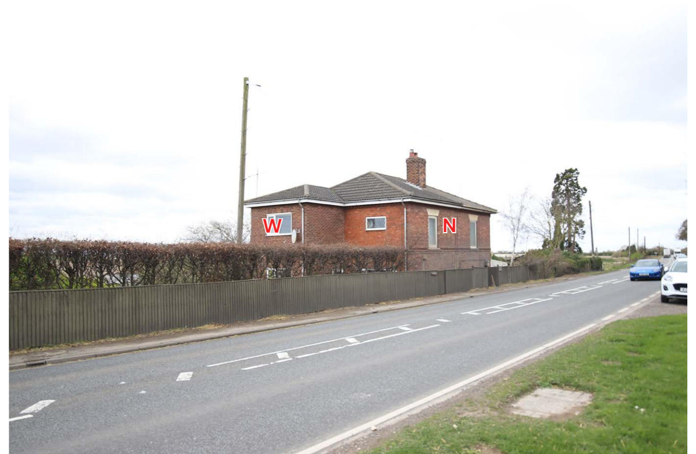
Northern and western elevations