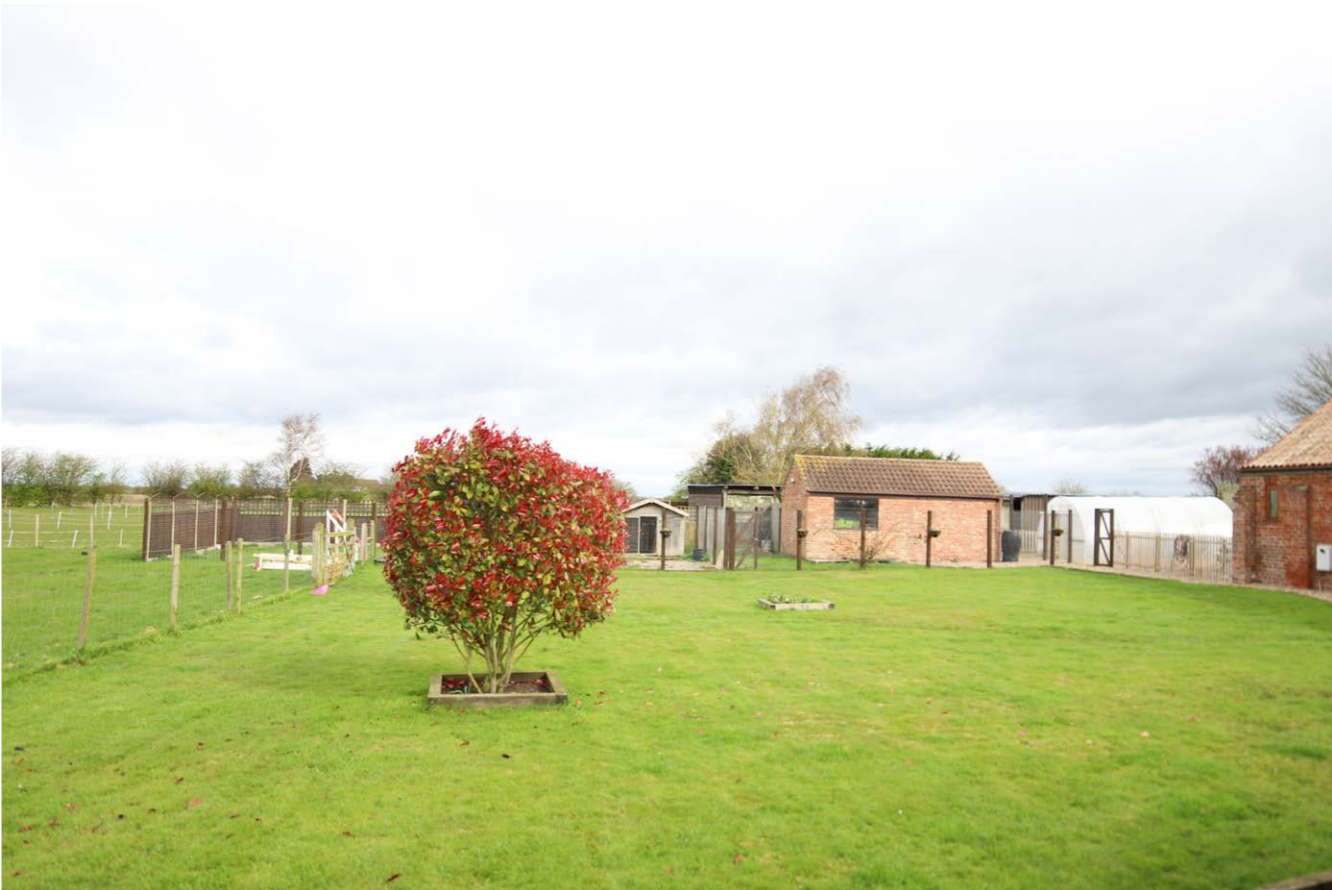
Rear garden and outbuildings