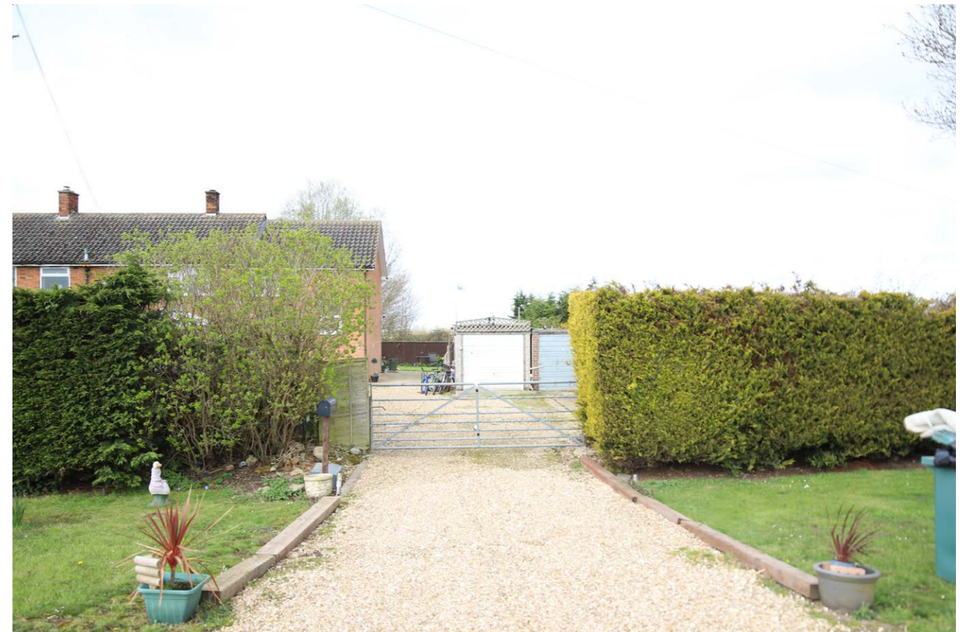
View towards the Energy Park between the dwellings