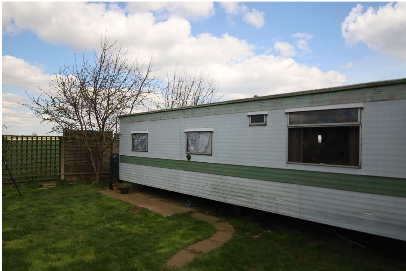
Caravan in the rear garden