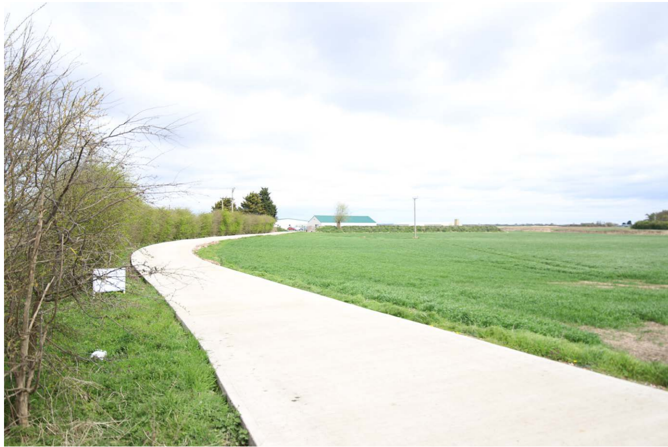
Looking towards Rakes Farm from the A17