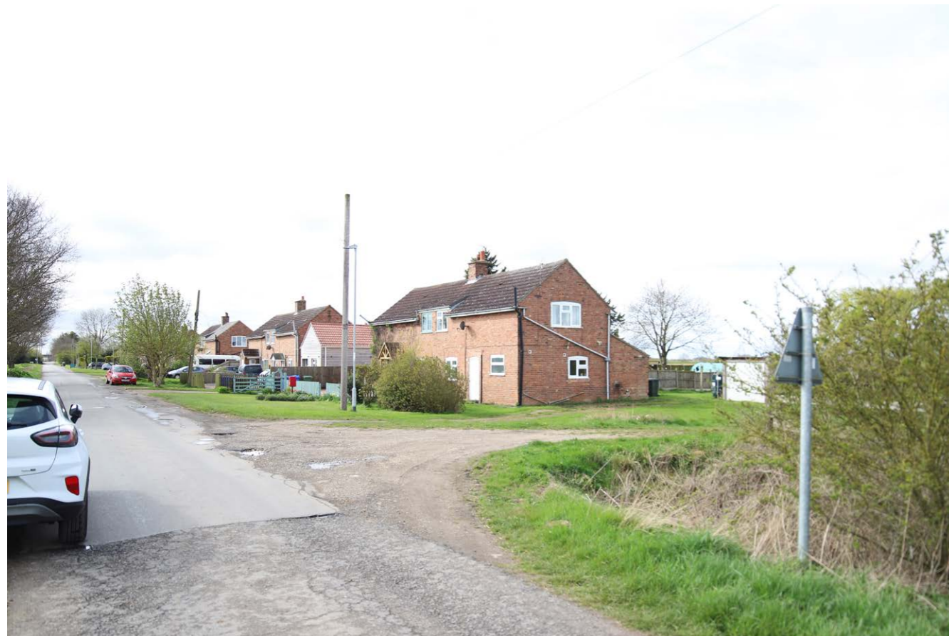
Eastern elevation addressing Brown's Drove