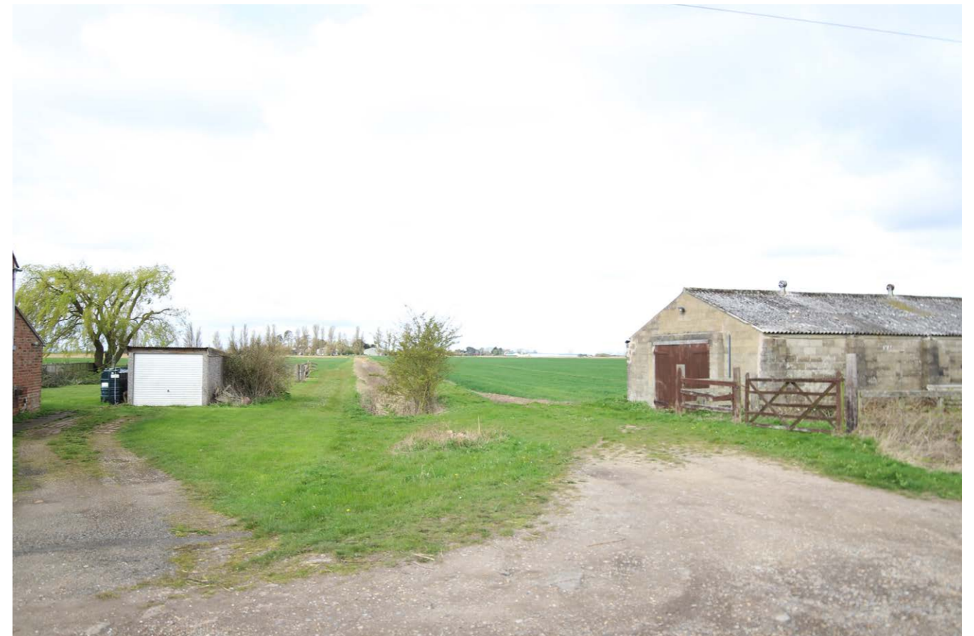
View towards the Energy Park from the northern edge of the cluster