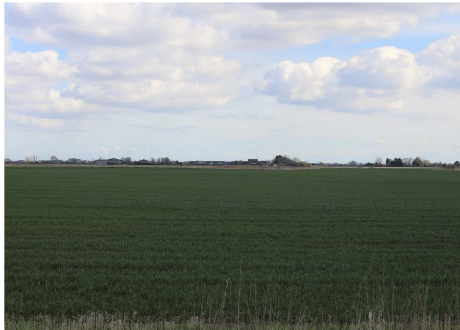
View towards College Farm and Caton House