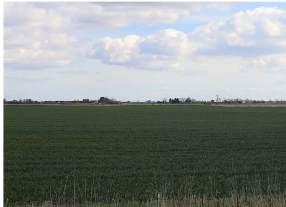
View towards College Cottage