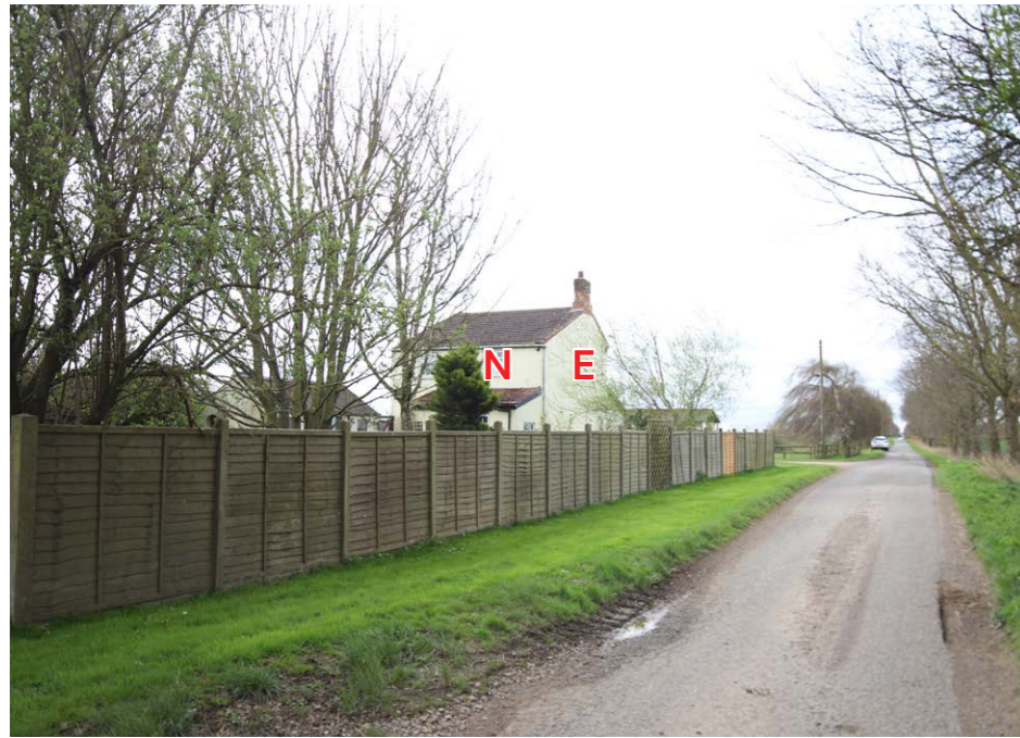
Northern and eastern elevations