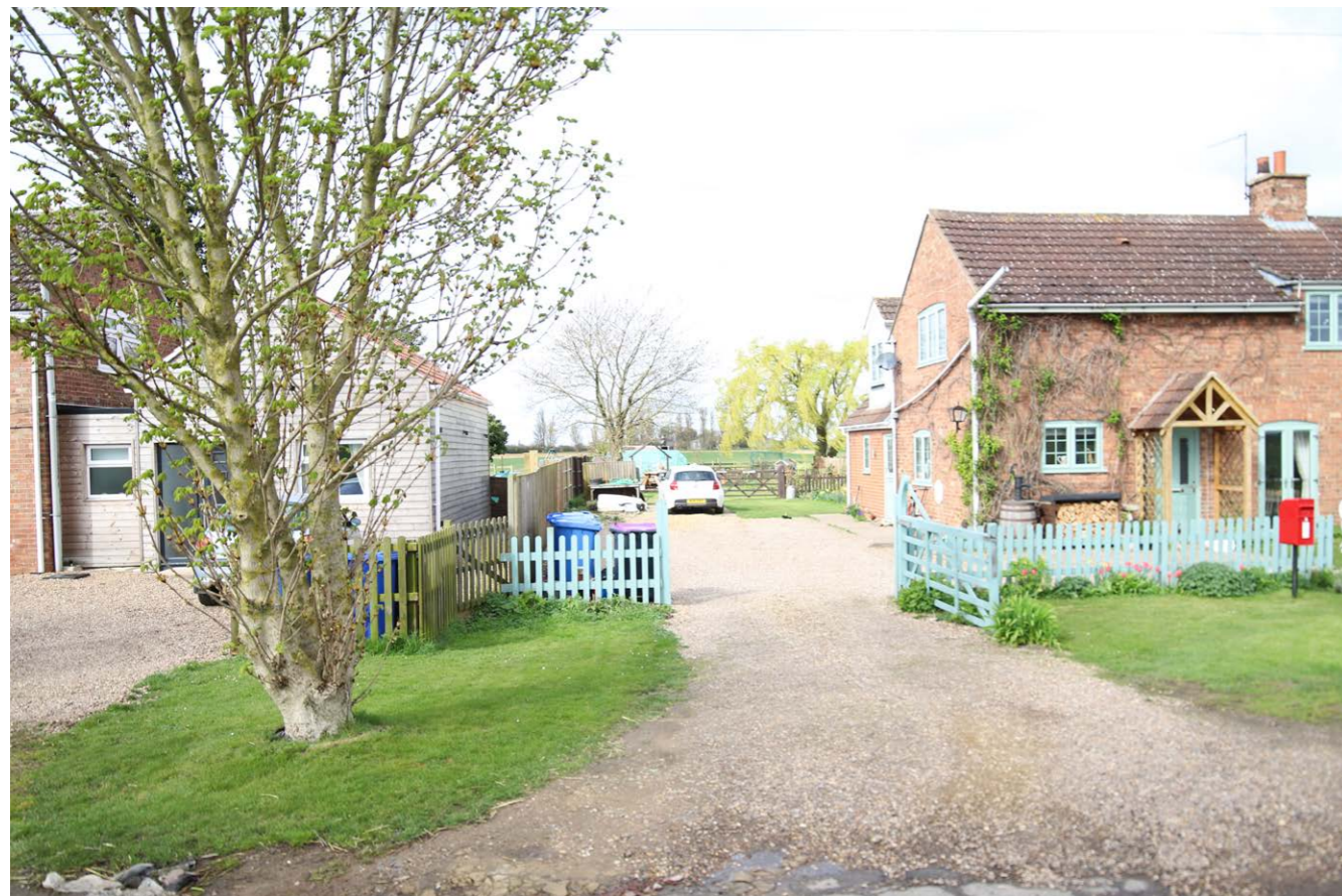
View towards the Energy Park between the dwellings