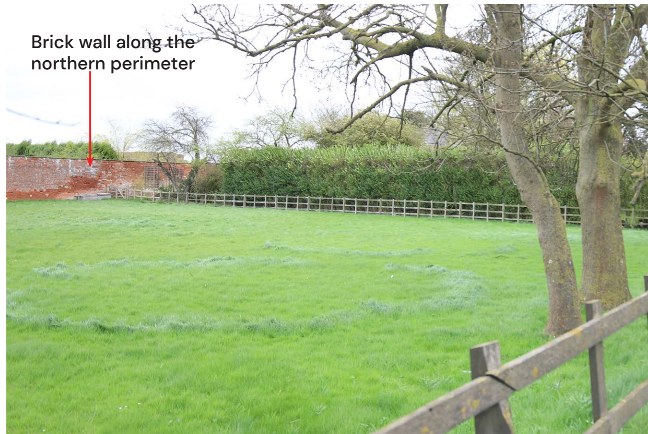
View from the road verge towards the western boundary