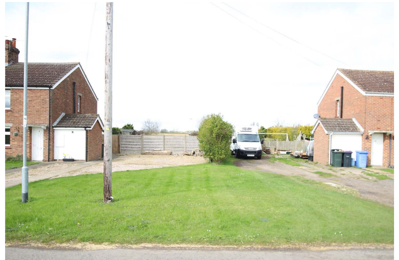
View towards the Energy Park between the dwellings